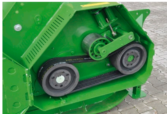
Autom. Keilriemen-Spannvorrichtung Automatic drive belt tensioner