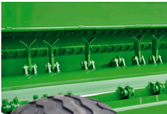
Universelle Y-Messer Universal flail blade

Einfacher Zugang für Wartung und Reinigung Easy access for service and cleaning